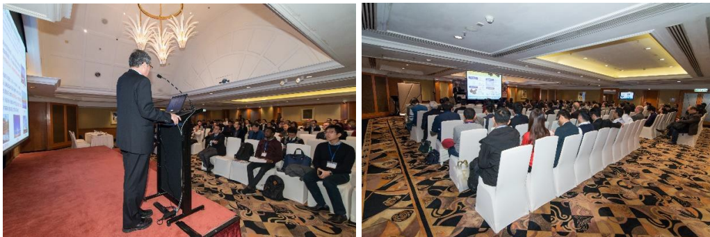
Participants of the conference

In the past 22 years, the HKSTS annual conference has become stronger and grown in size and scope, and become one of the leading regional conferences in transportation. The 23 rd International Conference of the Hong Kong Society for Transportation Studies to be held on 8 th – 10 th December 2018 will be jointly organized by HKSTS and Department of Electrical Engineering and Department of Logistics & Maritime Studies, The Hong Kong Polytechnic University. More information on the conference can be found at the HKSTS website at: http://www.hksts.org/conf.htm .