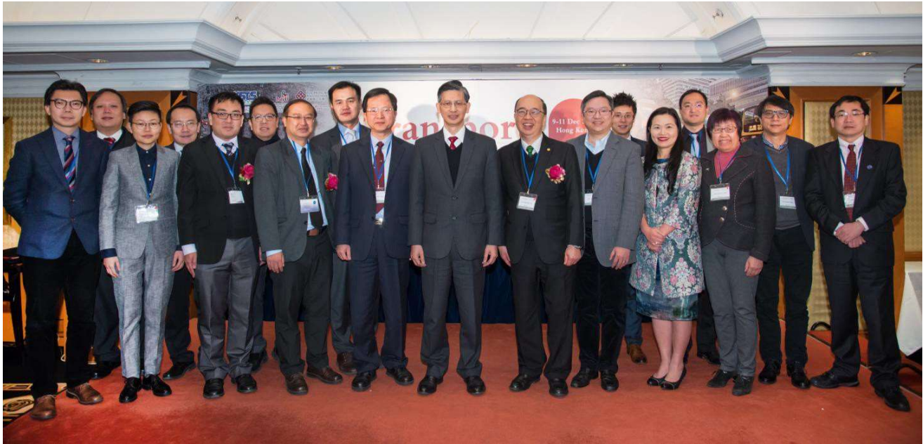
Board members of the HKSTS and guests

Department of Civil and Environmental Engineering, The Hong Kong Polytechnic University