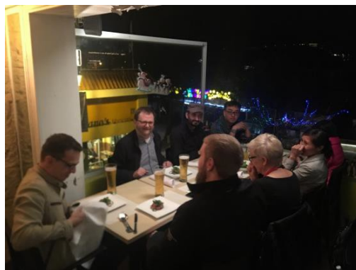
Participants of Social Tour at Stanley on 10 th December 2017 (Sun)