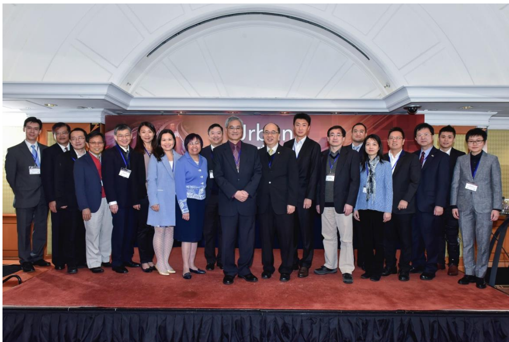
Group photo of 20 th conference organisers, sponsors and plenary speakers

As HKSTS stands on the cusp of its third decade, we are happy to see that the conference has grown to be a recognised annual focal event in the field of transportation research. We hope the HKSTS conferences will go from strength to strength, contributing to the advancement of research and the kindling of new ideas in all fields of transportation studies in the future. The 21 st HKSTS conference, co-hosted with the Department of Construction Technology and Engineering of the Technological and Higher Education Institute of Hong Kong (THEi), will be held on 10-12 December, 2016. More information on the conference can be found at the HKSTS website at: http://www.hksts.org/conf.htm .